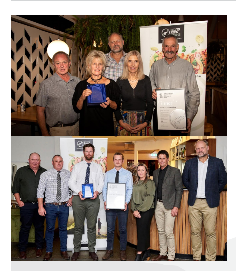
Plate to Pasture Awards

Festivities continue for the 2022 Plate to Pasture Awards, with finalists celebrating in the Eastern and Western North Island. We continue to see outstanding suppliers, displaying an exemplary understanding of what our consumers want from their red meat products and the farming systems their animals come from.