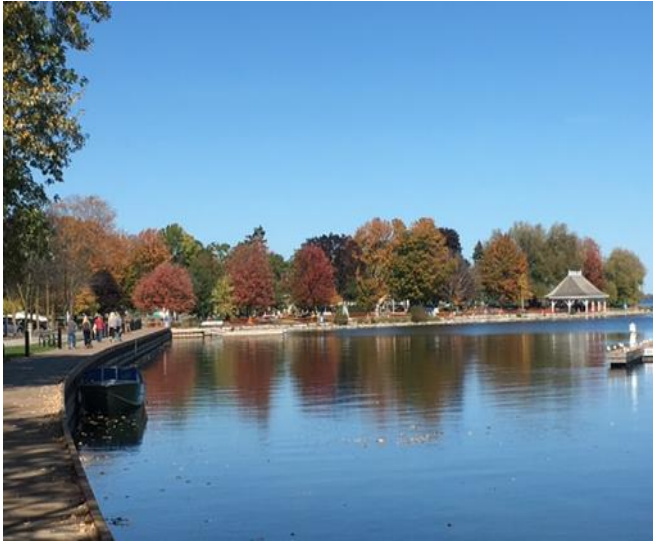
Couchiching Park in Orillia filled with fall colours.