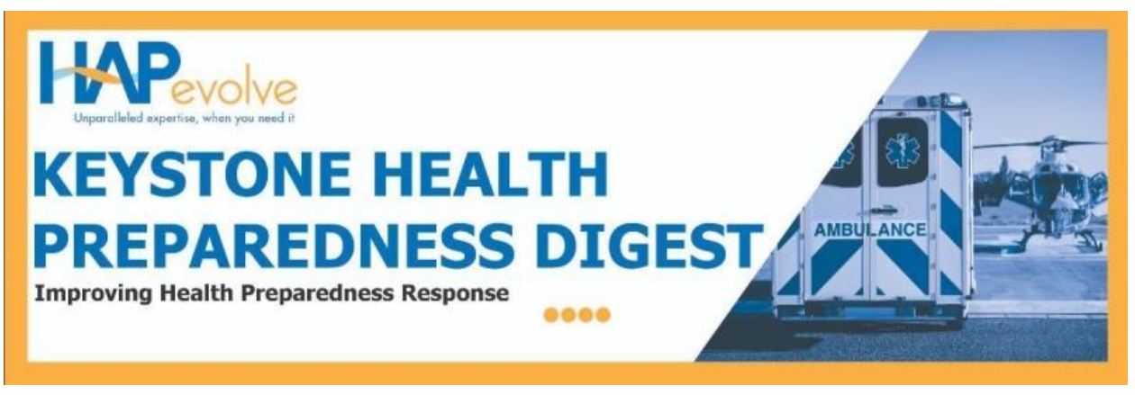
July 19, 2023 Volume 12, Issue 14